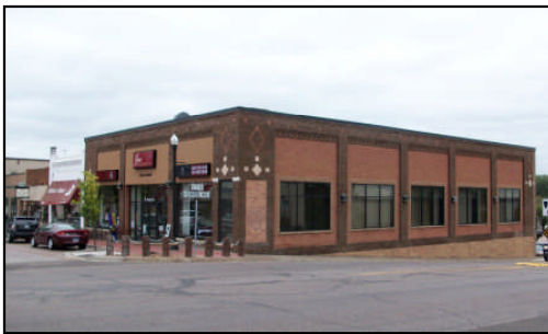
Gentz Financial Services, Inc. has relocated to 2 Division Street E, Suite 201 (formerly the Boyd building downtown) 763-682-5859