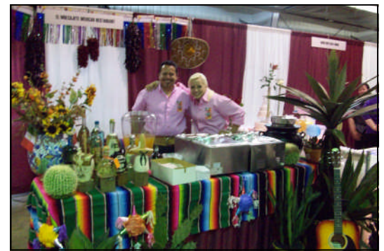
Most Creative Booth - El Molcajete

Mark your calendar for September 22, 2011 - the 3rd Annual Taste of Buffalo !