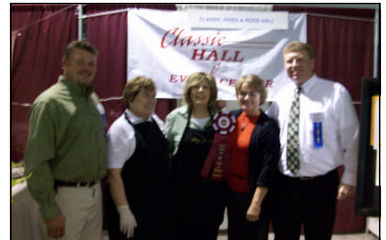
Most Creative Food Item - Classic Rides & Rods Hall