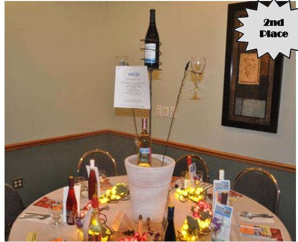
BUFFALO ROCK WINERY