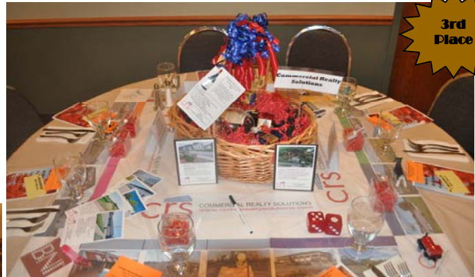
COMMERCIAL REALTY SOLUTIONS