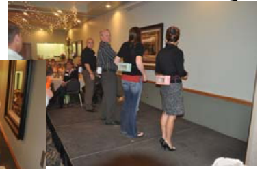
Table Decorating Contest