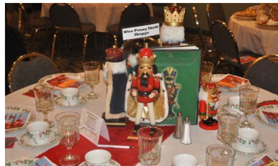
WISE PENNY THRIFT SHOPPE